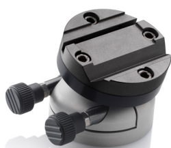
tiltable work holder