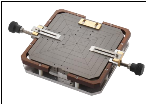
6x6" workholder with Vacuum and mechanical clamping