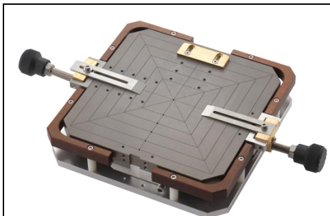
6x6" workholder with Vacuum and mechanical clamping