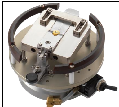
TO workholder with mechanical clamping