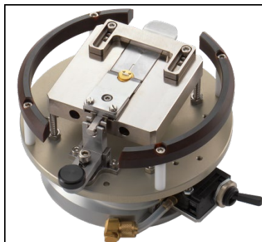
TO Workholder with mechanical clamping