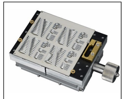
4x4" workholder with . rubberized surface and mechanical clamping